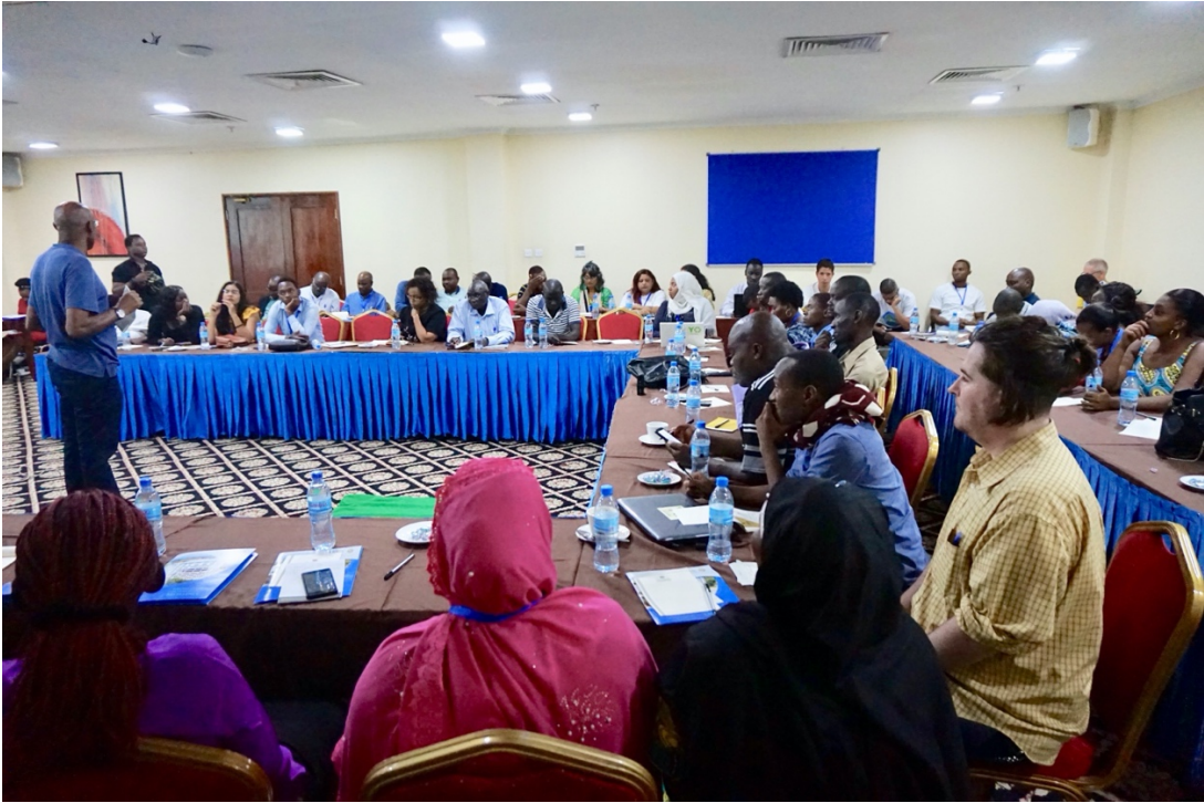
Photo: Workshop session in Dar es Salaam