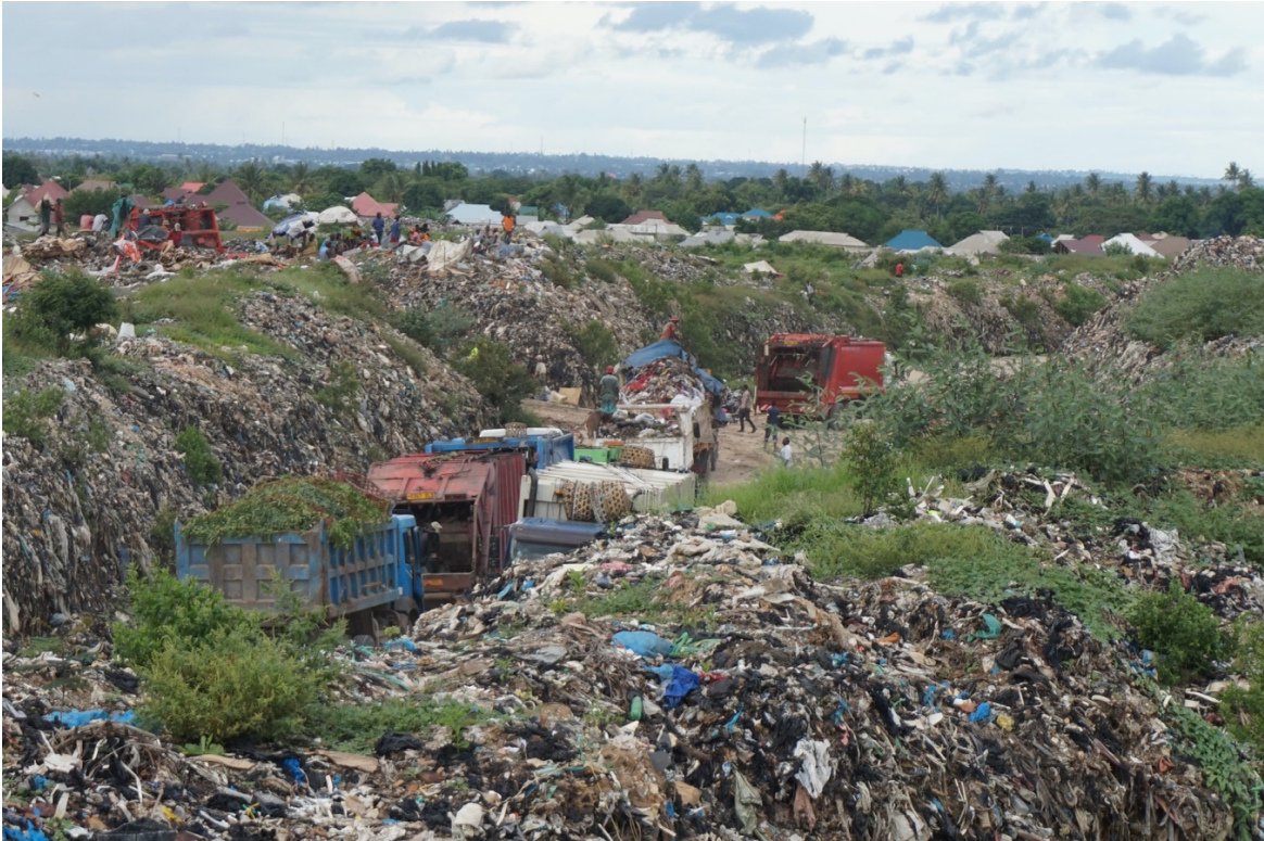
Photo: Informal recycling at the dumpsite at Pugu, Dar es Salaam