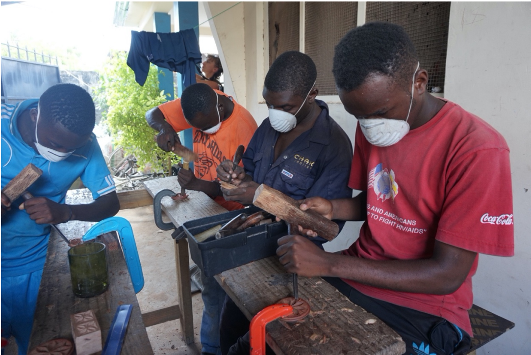
Photos: Glass and wood reworks

In Zanzibar we had the opportunity to visit several grassroots initiatives working with recyclable materials. These social enterprises and projects provide livelihood opportunities for men and for women.