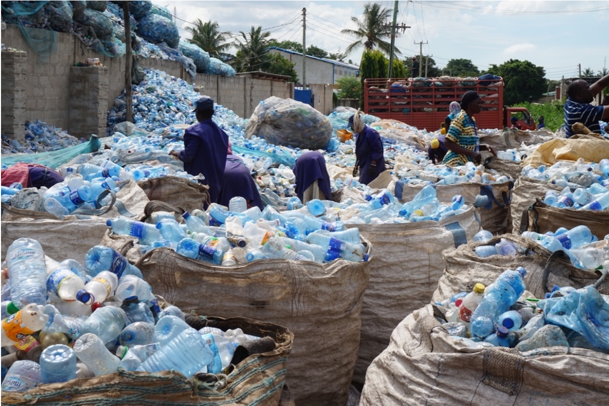
Photos: Reception of PET plastic bottles at the Chinese industry